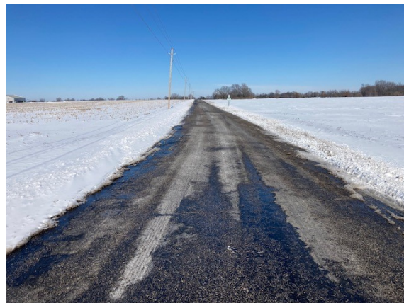
Looking north on Davis Lane shortly after the end of the storm.