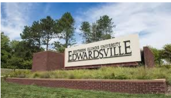
Southern Illinois University Edwardsville's Small Business Development Center

https://www.siu.edu/business/sbdc/index.shtml