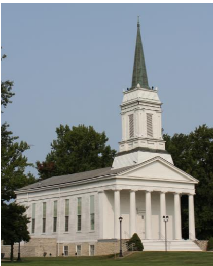
Lewis and Clark Community College

The following colleges offer business courses (online and on campus options available):